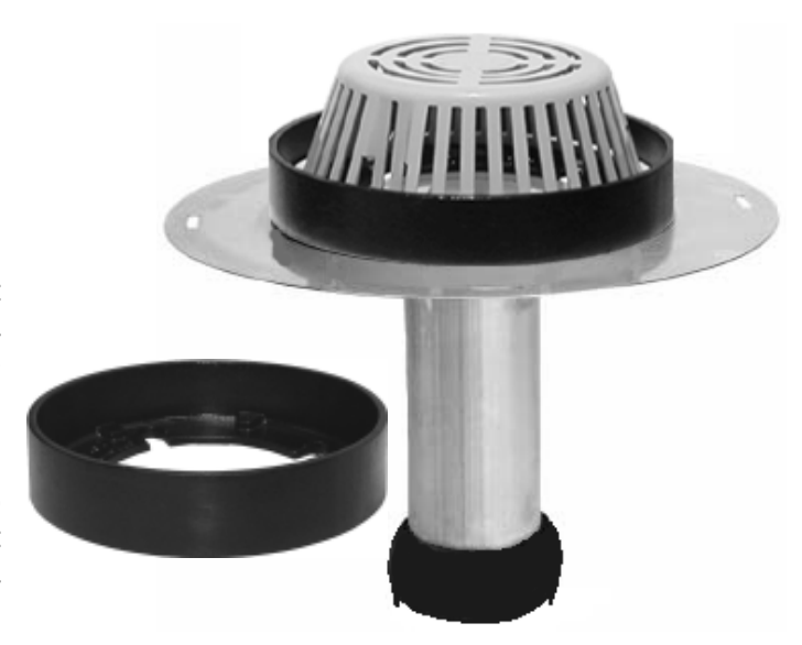
Rubber Seal- US PATENT NO. 6,647,682

Drain shall consist of a molded ultraviolet stabilized polyethylene or cast aluminum dome strainer, a cast aluminum epoxy coated overflow clamping ring, and a reroof drain of (choose one: injection molded black ABS flange and outlet tube, injection molded white PVC flange and outlet tube, spun aluminum flange with extruded aluminum outlet tube, or spun stainless steel flange with extruded stainless steel outlet tube). The outlet tube shall have a pre-compressed modified asphalt impregnated expanding foam, sealing tape, having a temperature range of -40 F to +185 F and 150% minimum elongation (available in 3", 4", 5" and 6") or rubber seal which requires no special tools (available in 2", 3", 4", 5" and 6"). Attachment and installation shall be done in accordance with Portals Plus' instructions and the roofing membrane manufacturer's recommendations.